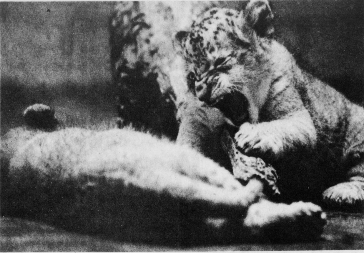
PLAYFUL PUSSYCATS — A playful lion cub annoys his lazy brother at the Denver, Colo., zoo. Both are recent births at the zoo born to Holly, a long-term resident there.