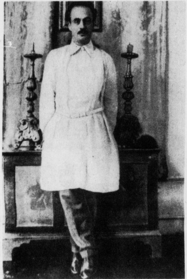
KAHLIL GIBRAN: Omar Shariff or Dustin Hoffman?