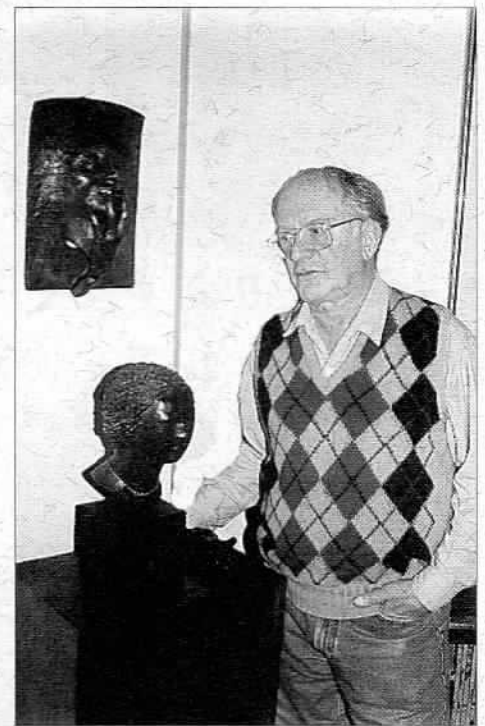
“Art is the expression of experience.”