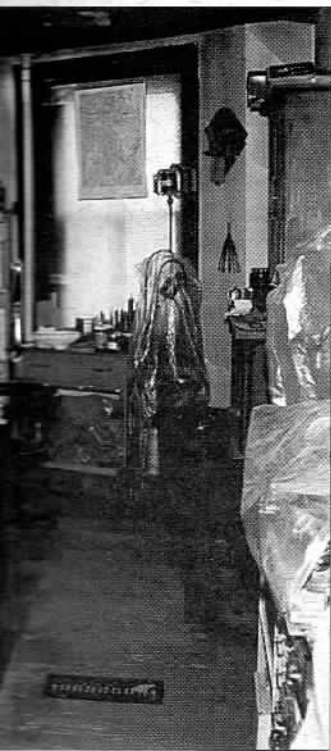
h thousands of tools, sk

elected, and if you don't see search lights in the sky, Hoover will be elected." Kahlil saw the searchlights in the sky that night.